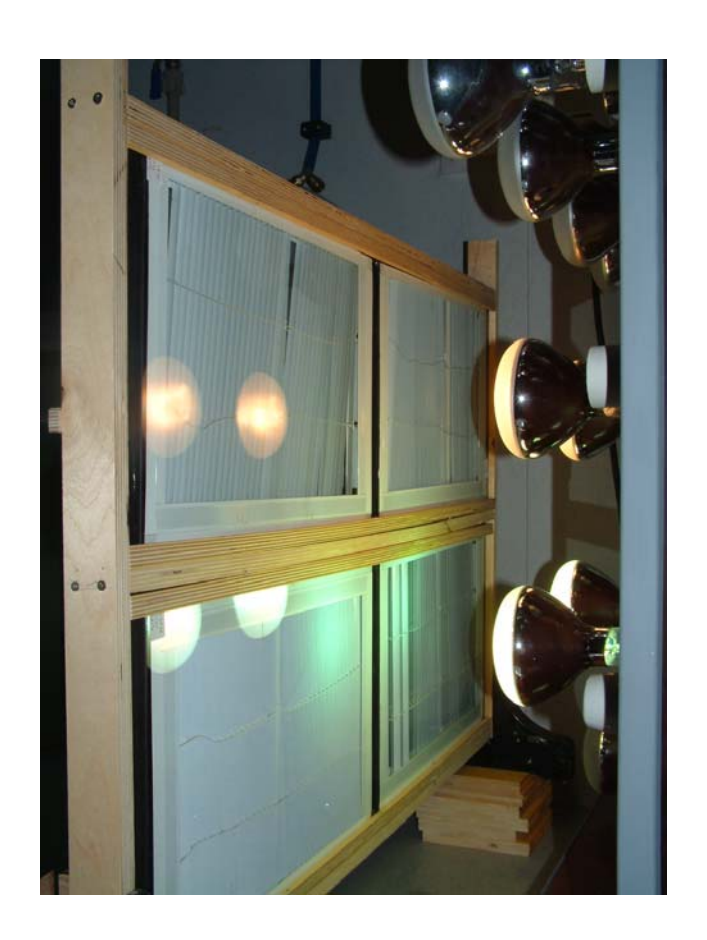
Fitting the lamps